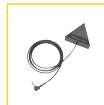
Conference boundary microphone for meetings. 2-metre sensitivity radius