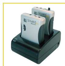
Drop-in charger. Easy automatic charging of up to two Solaris Flex units. (Units not included). Up to 5 chargers can be piggy-backed from one mains connection for simultaneous charging of up to 10 Solaris Flex units.