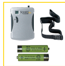
Solaris Flex transmitter incl batteries and belt