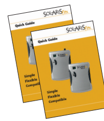
Two copies of quick guide