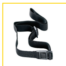
Belt for wearing transmitter or receiver