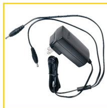
Power supply 2-way