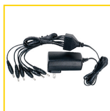
Power supply. 6-way for charging 6 units simultaneously

SUPPLIED EXCLUSIVELY IN THE UK AND EIRE BY P.C WERTH