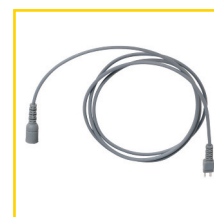
Direct audio input cord with standard hearing aid connector. Mono or binaural. Choice of 2 colours and 2 lengths