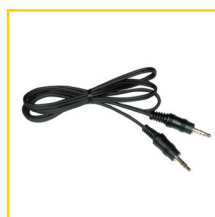
Aux cable, 3.5mm stereo/3.5mm stereo