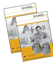
Two copies of user guide