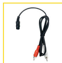
Audio input cord for connection of external sound source (eg PC, TV, Hi Fi, Video Conference etc)