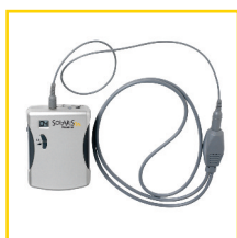
Neck loop, for use with hearing aid in "T" position, when no direct audio input is available