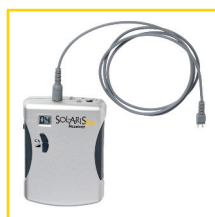
Direct audio input cord with standard hearing aid connector. Mono or binaural. Choice of 2 colours and 2 lengths