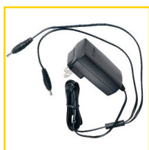
Power supply. 2-way for charging 2 units simultaneously