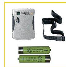
Solaris Flex receiver incl batteries and belt