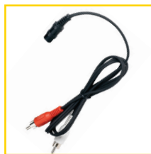
Audio Input Cord