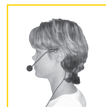
Behind-the-neck microphone 2.5 mm