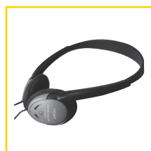
Walkman style headset