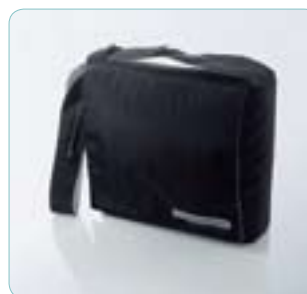
Dedicated carrying bag