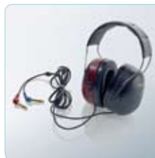
Noise reducing headset (optional)