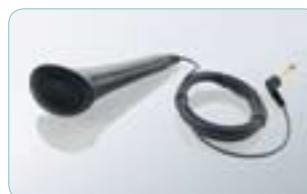
Patient response button (optional)